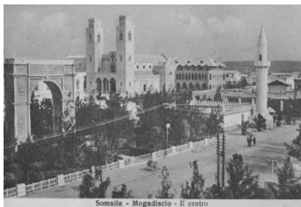
Somalia - Mogadiscio - Il centro

Italy joined Germany and Japan against the Allies (Great Britain, France, the US, and others) during WWII. In August 1940, Italy invaded